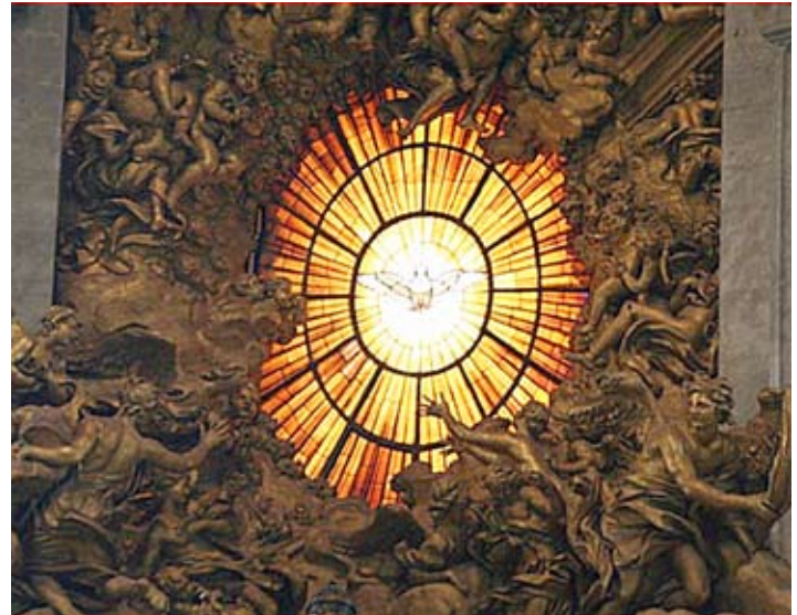
Gathering of the faithful window detail

God has brought you here this week for a reason. It's important for you to be here because what we are doing is important—I believe that this revelation is the single most important project on this planet today. While we do care that our brothers and sisters have enough to eat, good medical care, and proper education, our concern is for their eternal soul. God has given us this opportunity and this responsibility. You have made the choice to be a leader of the Fifth Epochal Revelation. There have been