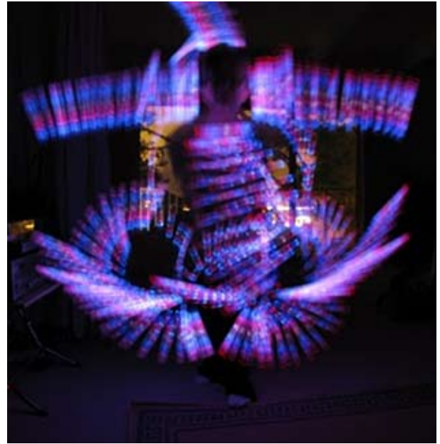
Moved by the spirit image

Spiritual development depends, first, on the maintenance of a living spiritual connection with true spiritual forces and, second, on the continuous bearing of spiritual fruit: yielding the ministry to one’s fellows of that which has been received from one’s spiritual benefactors. [Paper 100:2; page 100:2]