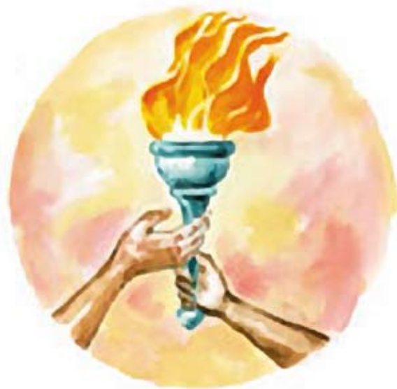
Passing the torch illustration

The urgency is apparent. We need only to look around us to know that our world is changing. Paradigm shifts are occurring in all of our institutions: political, social, financial, and religious. These changes are happening at an ever-increasing rate. We must raise new leaders who will carry on after us, who are equipped to meet the challenges and opportunities that this new era presents. If not now, then when?