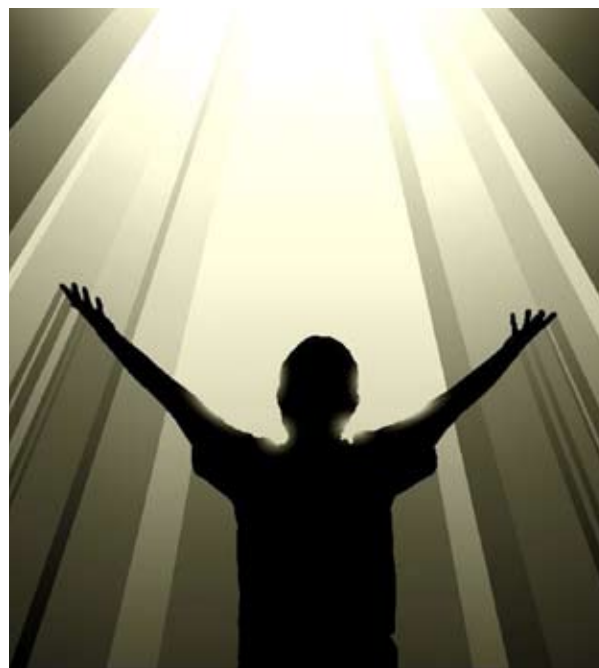
Receiving light, illustration