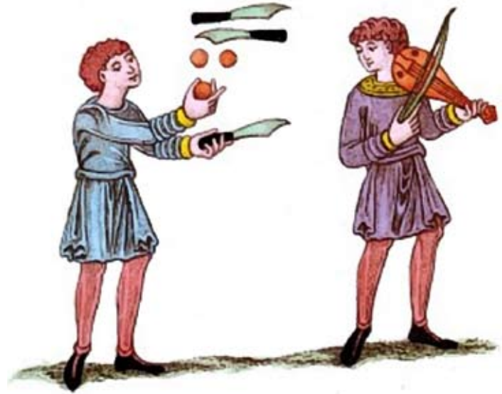
Mastering a skill illustration

Today we have over seven billion people in the world, and most of these are followers of one religious leader or another, all following the spiritual practices these leaders recommend. The question that keeps coming up for me is why we have not collectively progressed spiritually. Yes, we have progressed some; in my lifetime I have seen increased interest in spirituality and increased concern about the welfare of the planet, but our efforts have not had the spiritual power to truly reform individuals. In our society the family unit—the crowning glory of the evolutionary struggle—is disintegrating. This year has been the first since statistics have been collected where families with the original parents living with their children are in the minority. We live in a society where children are killing children because they have no role models to follow and where our leaders lack integrity and in some countries are even violent towards their people. We live in a society where there is gross indifference towards others and a lack of sensitivity. Why?