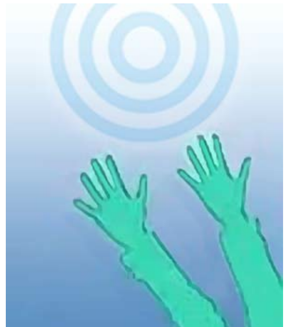
Receiving a revelation illustration