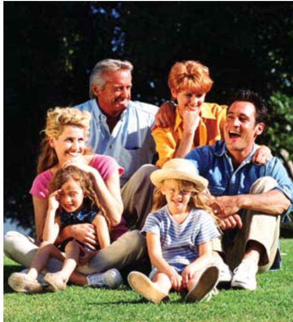
“Who Am I” photo.

I believe one of the quotes above has already answered that question. An agent of action is a spiritual being or mortal creature of progressive experience who