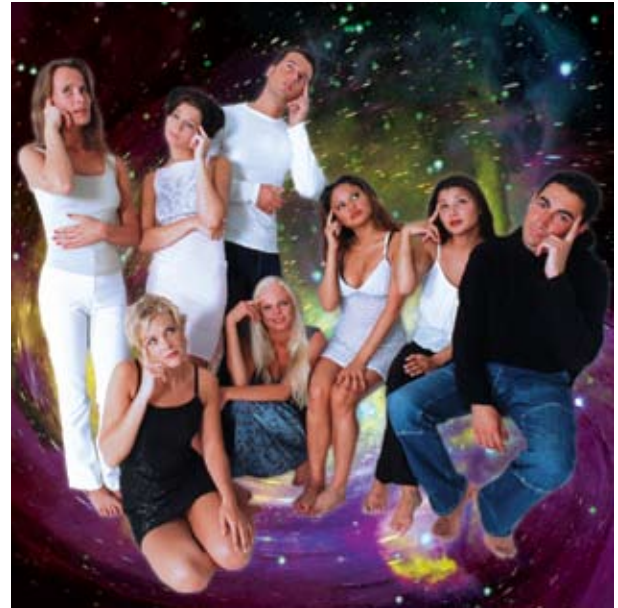
Who Am I collage.

This has led me on a quest to discover just what that reason is. I have always been one to ask, "Who am I?" "Am I alone in the universe?" "Why am I here?" "Where am I going?" It is perhaps a natural consequence of this quest that The Urantia Book came into my hands.