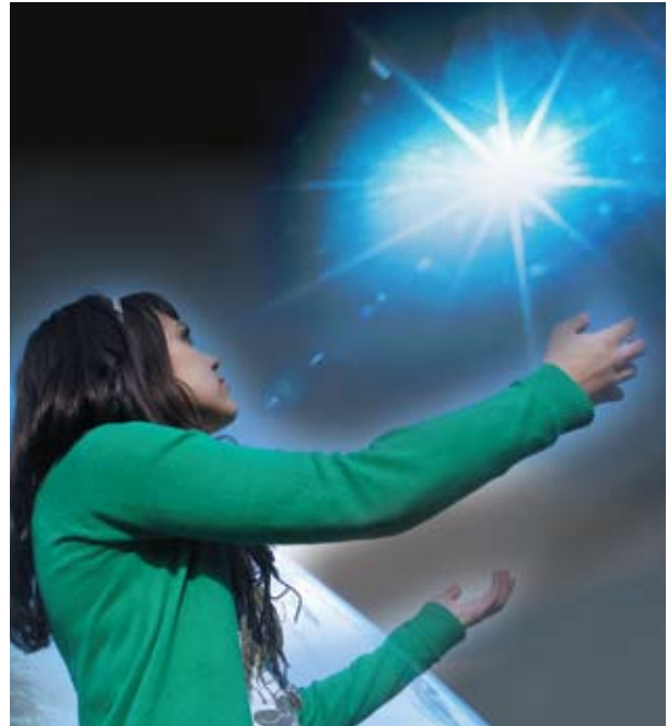
“Who Am I” collage.

Before sharing why I believe this baggage to be well suited to my post-revelation ascension career I wish to make two things clear. First, I claim not that I understand, but that I want to understand; and second, I hope you will