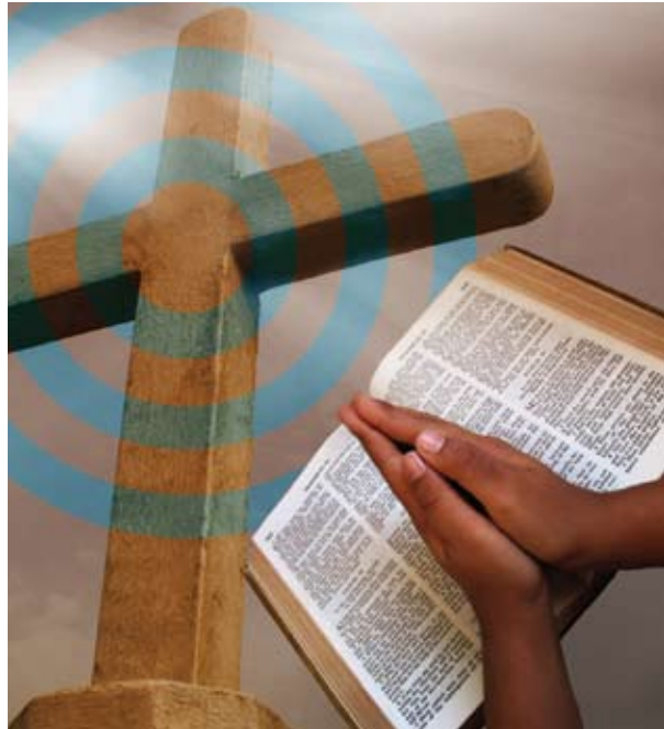
“The Urantia Book And My Christian Faith” collage.

Therefore, when my bus driver told me that Jesus wanted to know me personally, to be my friend, it was all very new to me but it was enough to excite my childhood imagination. “Yes,” I said, and believed.