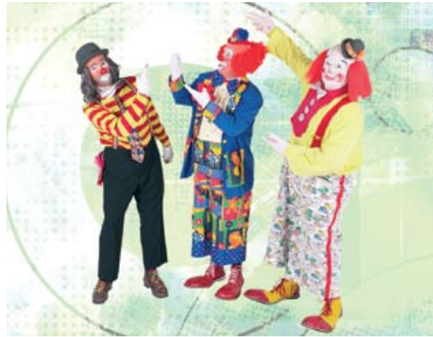
"The Second Mile" collage.

Jesus made no distinction between his life and his work. No matter what the job, Jesus used it as a way to further his mortal and divine career. Jesus was a teacher. His lessons were on love and his method was service. From his family life though his public campaign, you can see Jesus' organization developing. In the Nazareth home, those siblings allowed to attend school instructed