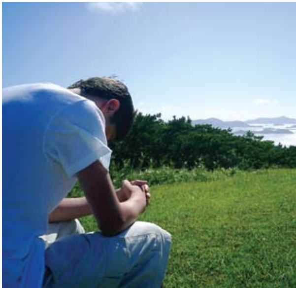
*The Urantia Book And My Christian Faith* photo.

Christ Michael did not progressively become God. God did not, at some vital moment in the earth life of Jesus, become man. Jesus was God and man—always and even forevermore. And this God and this man were, and now are, one, even as the Paradise Trinity of three beings is in reality one Deity. [1331:3]