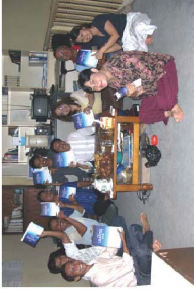
The Prana Cipta Urantia Indonesia study group displays new Urantia books