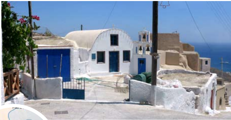
Santorini house where Pio stayed