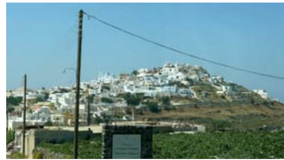
Santorini hill overlooking the Caldera

I'm a relatively a newbie TUB reader, having been given the book in 2001 while attending the FIFA World Cup games in Korea. I put it aside (being a bibliophile) thanking the nice new age lady in Korea and forgot about it until I hopped on the Northwest flight home and I realized I did not buy a book to read for the long flight. Then I remembered the awfully small print, onion skin, and dull (no pictures!) looking blue book was in my canvas carry on satchel. Over the North Pacific I started from the beginning and did not pause until I finished the book the following Halloween night.