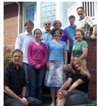
A close-knit group enjoying the moment

"The topic 'Bridging the Gap' between mortals and celestial reality was covered from various angles and the most poignant point from my perspective was this: All the spiritual direction, much of actual creation and the life of Joshua ben Joseph were for the express purpose of helping us to bridge the gap between our physical >>