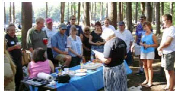
New England readers at Hopkinton State Park in Massachusetts