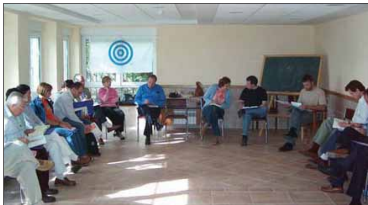
Readers attending the presentation of "The Evolution of Prayer"