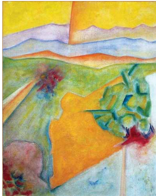
"Rainbow with Tree" © Morris Kaplowitz