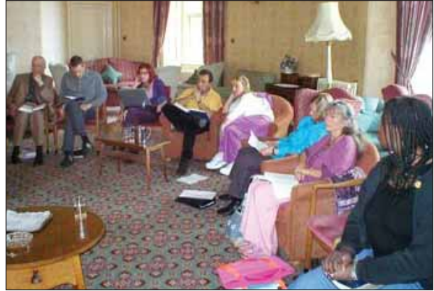
A study presentation