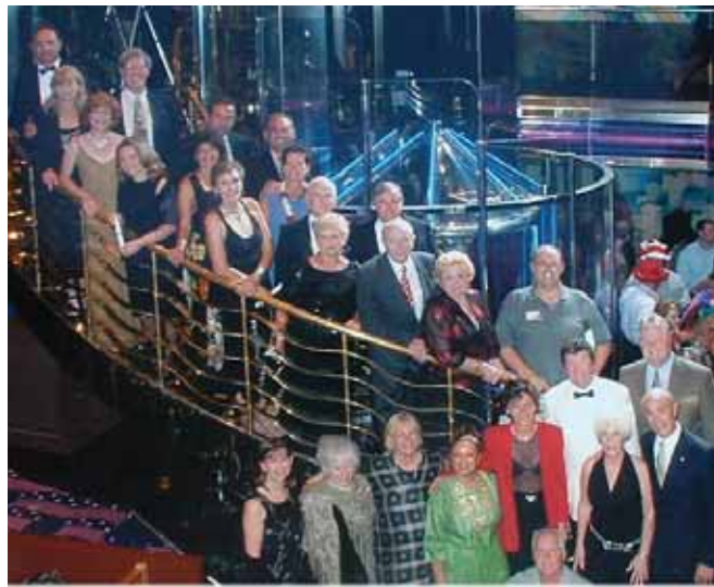
Formal Friday night, on the ship's staircase

Many were moved to tears as they wished each other aloha. Fond memories were built up in our minds and souls and we were all grateful for this experience of Cruising with the Midwayers to celebrate the fiftieth anniversary of the publication of the original Urantia book in 1955. □