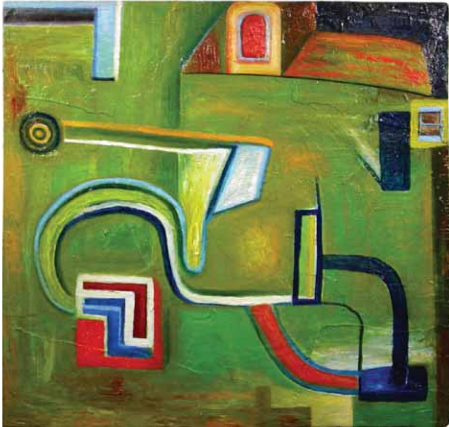
"Green Building"