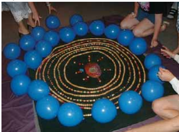
Jane Ploetz's mixed media workshop about structure of the universe

We had the morning free to shop and see the sights of New Orleans before we embarked on the Carnival Sensation. After yet another delicious group dinner on board, Matthew Hughes led off the first session with an extraordinary lecture