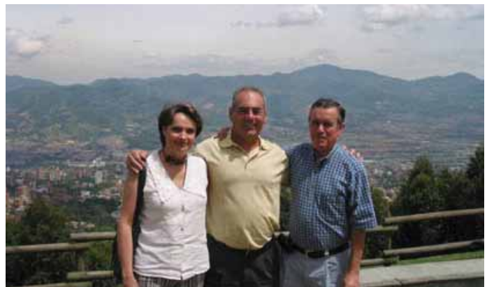
Friends in Medellín

augments all beauty and exalts all kindness. Through wise symbols, man is able to live and augment his capacity for the appreciation of his friends. This power and possibility of mutual stimulus of imagination is one of the supreme glories of human friendship. There exists a great innate spiritual power in the conscience of being consecrated full hearted to a common cause, of being mutually loyal to a cosmic Deity. □