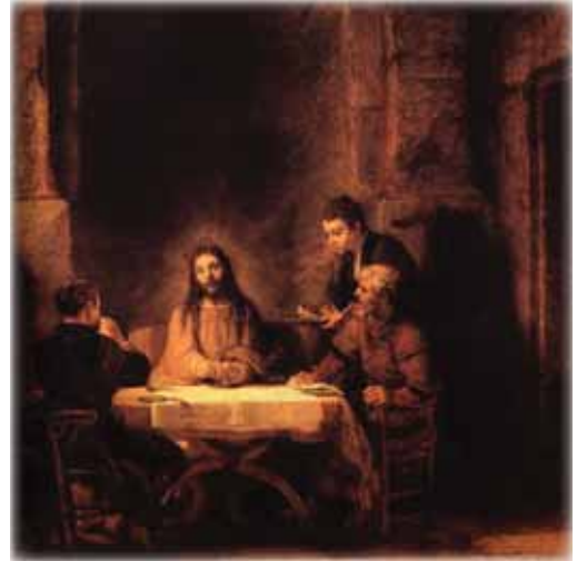
"Supper at Emmaus" Rembrandt van Rijn , 1629

We live our lives upon this world And try to learn right from wrong. The Spirit of Truth Is our conscience.