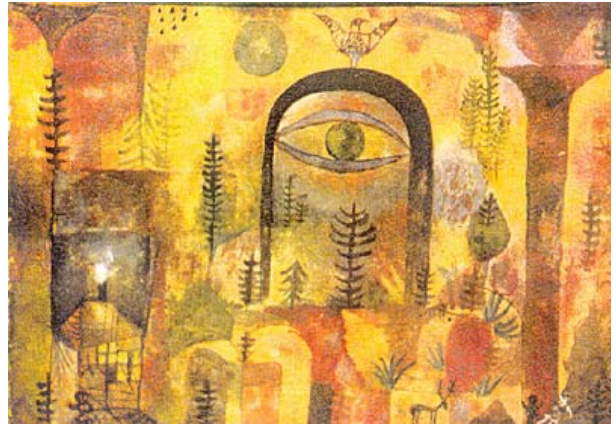
"With the Eagle" Paul Klee, 1918