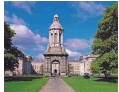
Trinity College, Dublin

As I viewed The Book of Kells I wondered if in 1200 years people might be similarly lined up by the thousands to view one of the early U rantia Book Revelations. The Book of Kells are beautiful manuscripts written on sheepskin parchment by monks who lived in the most austere conditions and protected the manuscripts from the Vikings in towers much like this one in Glendalough.