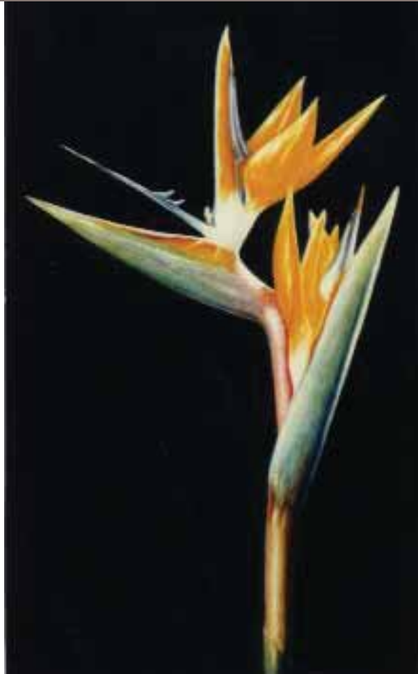
"Bird of Paradise" oil on canvas painting by Carlos Rubinsky (Buenos Aires, Argentina)