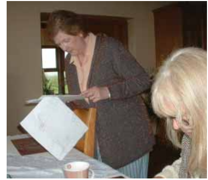
Guardian of the Megalith