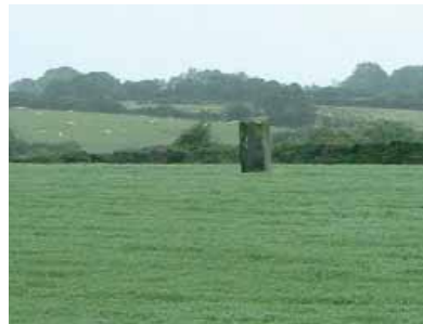
Megalith of Muff