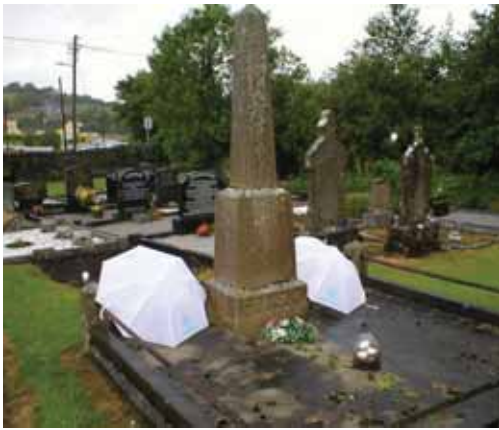
Graham Family Gravestone

the end of our two week trip around the Emerald Isle.