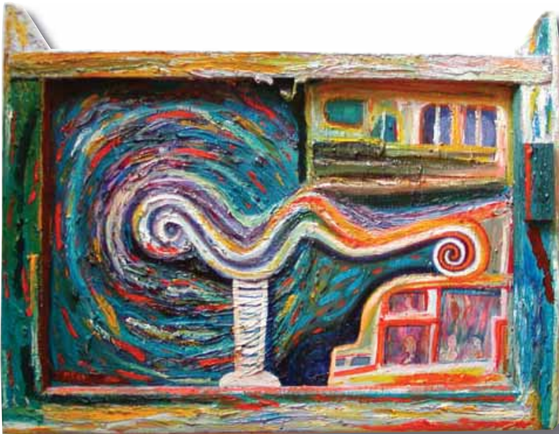
"Passengers" oil on window, painting by M. Caoile