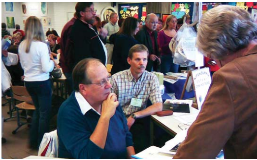
Two fairs: top, at the fair of "I Am" and bottom, fair of "Spirit and Knowledge"