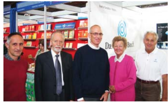
Presentation of The Urantia Book in Frankfurt, Germany at the biggest book fair of the German speaking area.