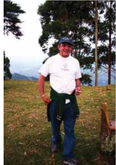
(December 16, 2006) Vice-President, Asociación Urantia de Medellin