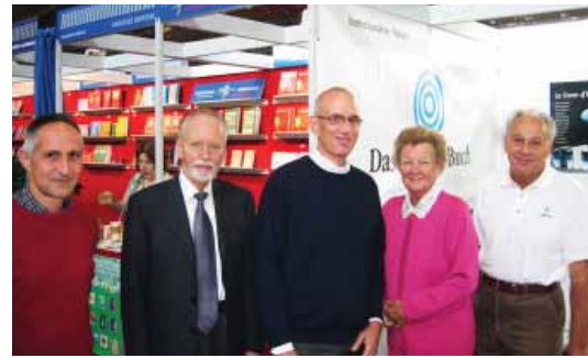
Presentation of The Urantia Book in Frankfurt, Germany at the biggest book fair of the German speaking area.