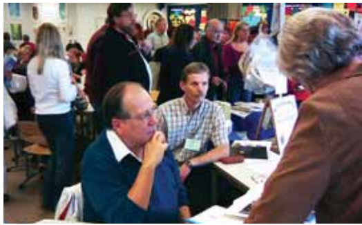
Two fairs: top, at the fair of "I Am" and bottom, fair of "Spirit and Knowledge"