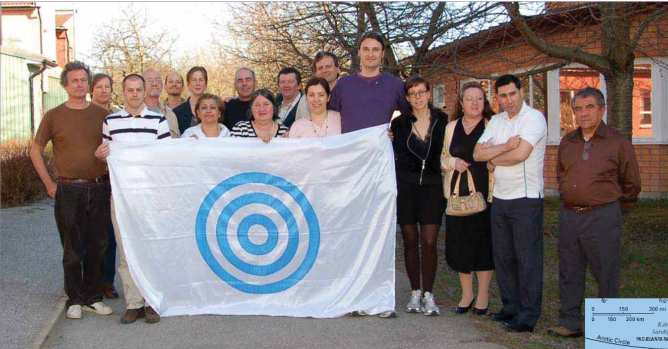
Group photo. More pictures of inauguration at http://www.urantia-uai.org/photos/index.html