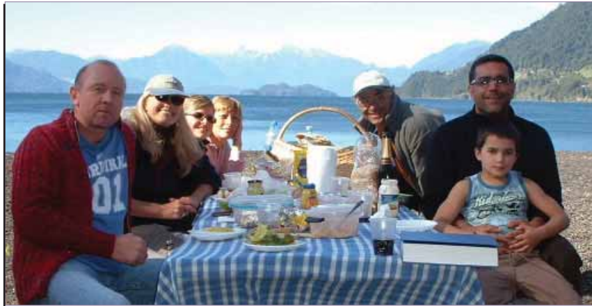
Picnic at Lago Todos Los Santos (All Saint's Lake)