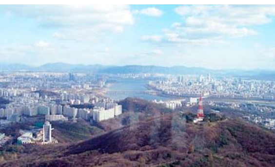
View of the Korean capital, Seoul