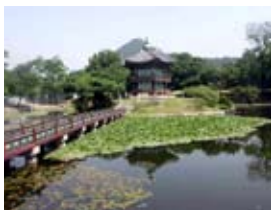
Scenic views of the beautiful Korean countryside