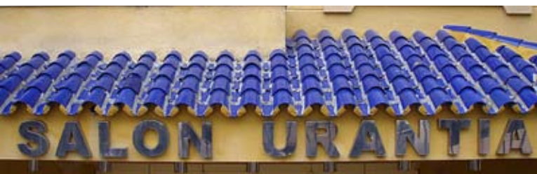
Permanent sign on building opposite the Hotel Vistamar (manager is a reader)