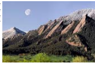
view of the “Flatirons” at the foothills of the Rockies – Boulder