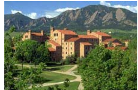
University of Colorado – Boulder

W E HAVE A WONDERFUL PROGRAM developed featuring both well established and up-and-coming speakers and workshop leaders. Evening entertainment will include a planetarium show, a private patio party with one of the most breathtaking views of Boulder and the mountains