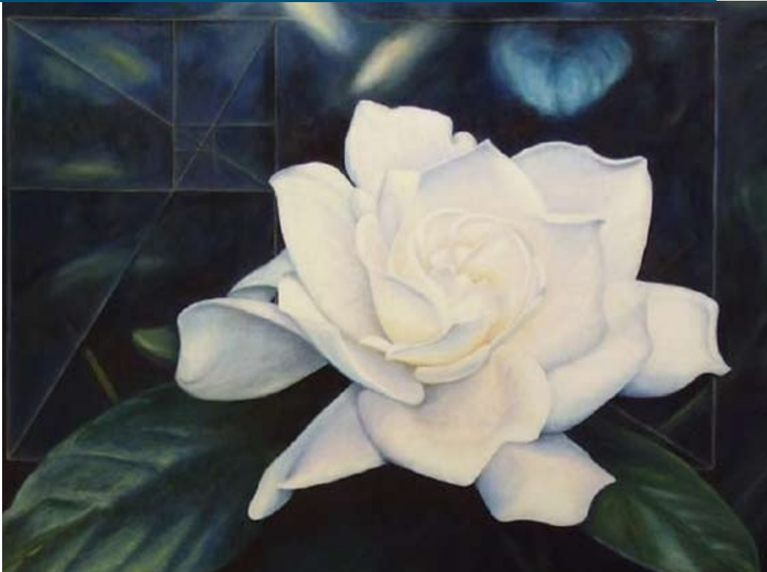
"Jazmin II" Oil Painting by Carlos Rubinsky