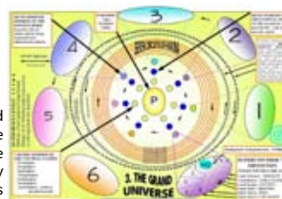
Grand Universe diagram, one of series by Hara Davis