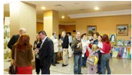
Welcome cocktail in the foyer