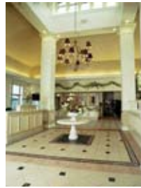
venue – the Hilton Garden Inn