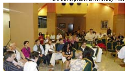
Attendees enjoying a study group session