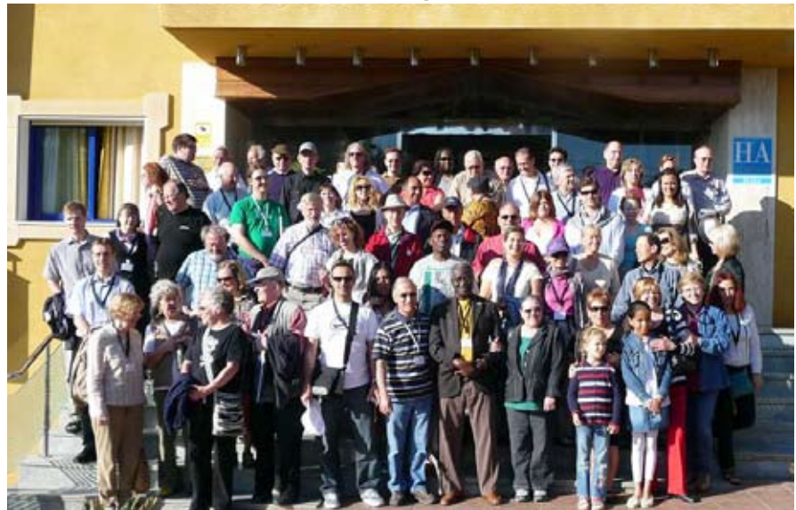
Group photo of those that came to "Bridge the Gap" – attendees at the International UAI conference Malaga, Spain

FOR THE URANTIA ASSOCIATION OF Spain, the sponsor of this event, it has been a long road to get here. A road of hard work and learning, which began as an idea in 2005, turned into a project in 2007, and today it is a good memory. We, readers of the book, know that there are no accidents, and to prove this I would like to tell you briefly about the developments which induced us to assume the sponsorship of this international conference.