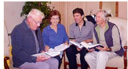
Canberra study group