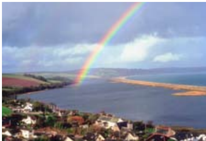
Rainbow over Devon, England

T HE URANTIA ASSOCIATION FOR THE United Kingdom & Ireland warmly welcomes you to their stand at the forthcoming Quest Natural Health Show that will be held at Newton Abbott Racecourse in glorious Devon, England the 2nd to the 5th July 2009.