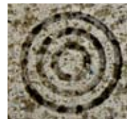
Circle Tile on Malaga Sidewalk

It so happened that the very next year, in 2007, the Representative Council of the UAI voted to hold the international conferences every third year, instead of every second year. This implied that the next conference would take place in 2009. That year we spoke to the director of the hotel about the possibility of our holding the international