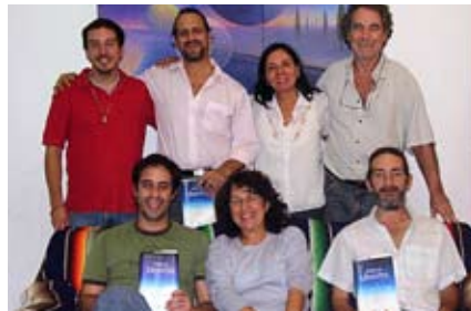
Argentina study group