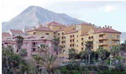
Hotel Vistamar – conference venue

B RIDGING THE GAP' IN MALAGA WAS my first international conference and I had a wonderful time meeting members from all over the world.